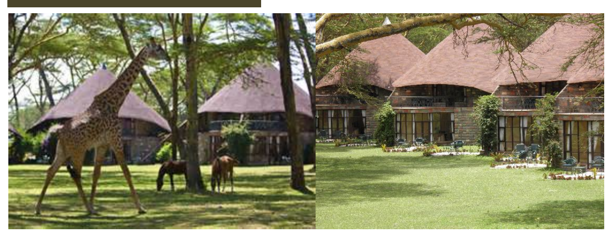
Naivasha Sopa Lodge: http://www.sopalodges.com/lake-naivasha-sopa-lodge/overview