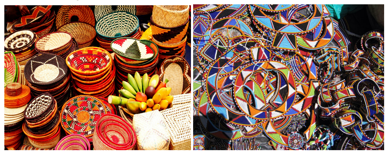
Thereafter you will be transferred to Runda for dinner and Overnight