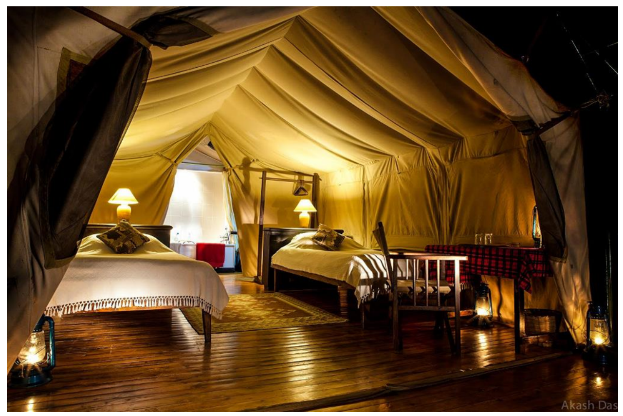
Sekenani Camp offers an authentic bush experience for those wishing to get close to nature. It is set at the source of Sekenani River, the camp offers a serene environment in which to relax, unwind and enjoy all the Mara has to offer. It comprises fifteen exceptionally well-designed tents set well apart to ensure maximum privacy. Each tent has a wooden floor and en-suite bathroom complete with a full-length bathtub. A combination of luxury and adventure.

After breakfast, depart and drive across the floor of The Great Rift Valley and Loita Plains to Maasai Mara Game reserve arriving at your camp for lunch. Early afternoon at leisure and later on embark on a late afternoon game viewing drive.